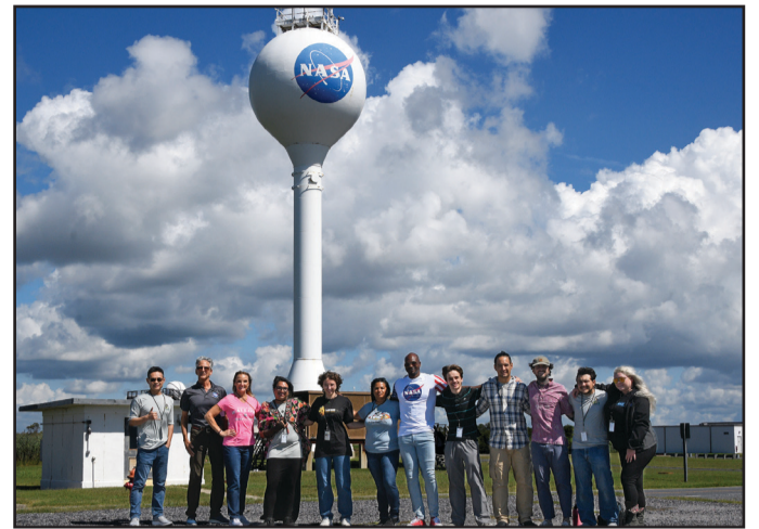
College of the Canyons team members traveled to NASA's Wallops Flight Facility in Virginia for the RockSatX launch on Aug. 11.

RockOn gives students an opportunity to work on introductory-level projects to gain experience for third-level projects. Experiments launch on a NASA sounding rocket.