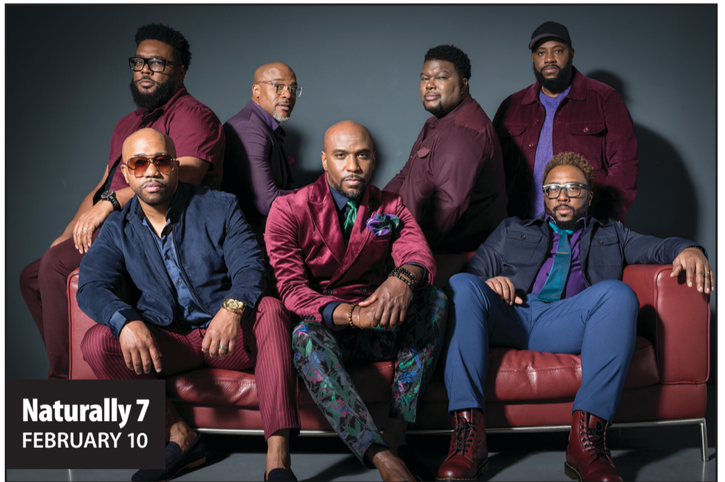
Naturally 7 FEBRUARY 10